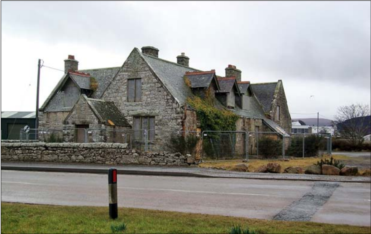
The former Old Clyne School pre-redevelopment.

which we can operate an expanded, year-round sustainable heritage business and securely store our nationally recognised collection in an appropriate, environmentally controlled space.