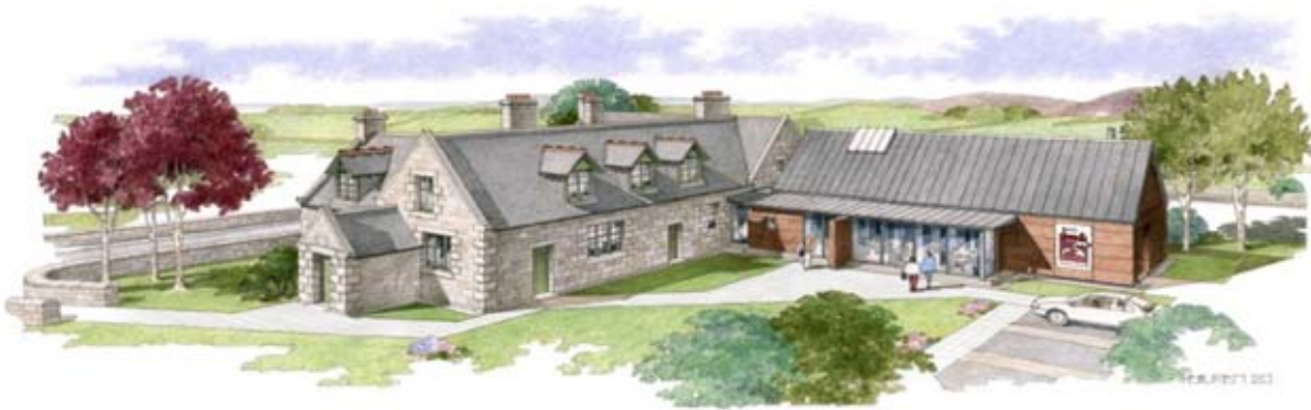
Artist's impression of the completed project.